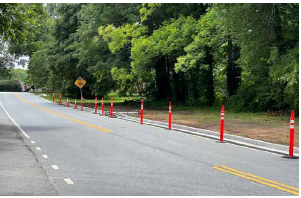
Once completed, the additional sidewalk on Hedge Street will extend from Crisp Street to Fernwood Road with a section on Fernwood that will finish the connection to South East Main Street.